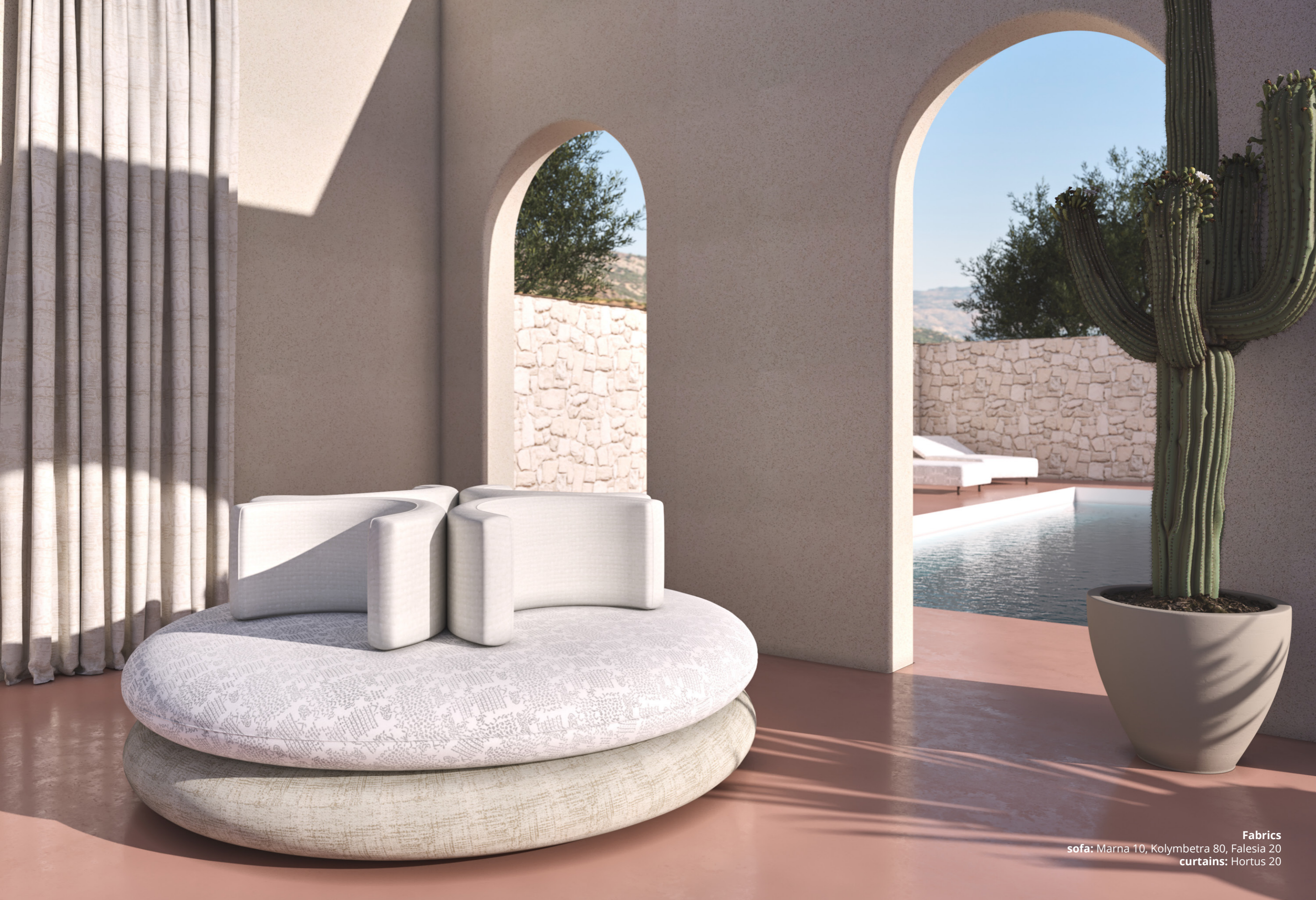
Fabrics sofa: Marna 10, Kolymbetra 80, Falesia 20 curtains: Hortus 20