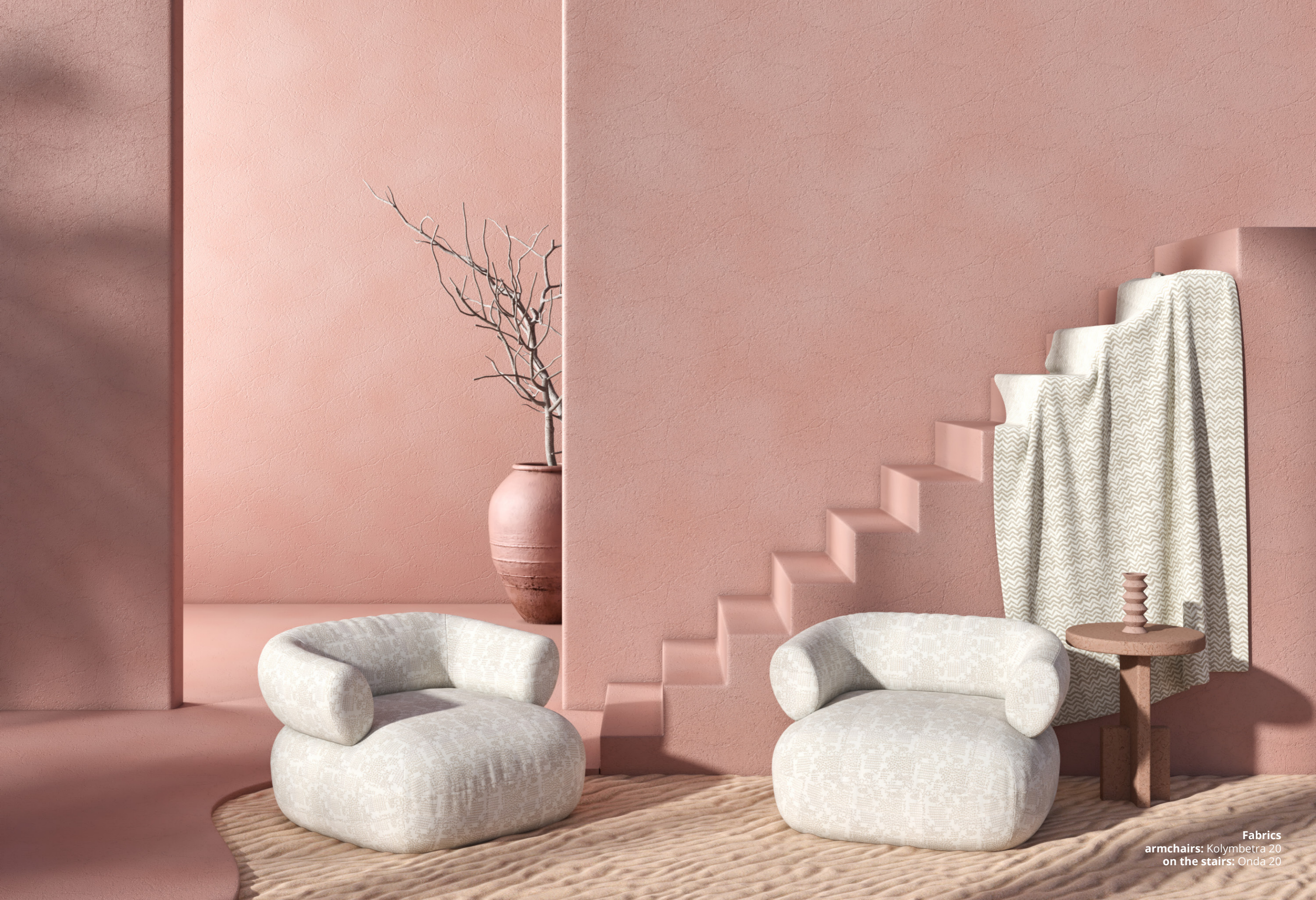
Fabrics armchairs: Kolymbetra 20 on the stairs: Onda 20